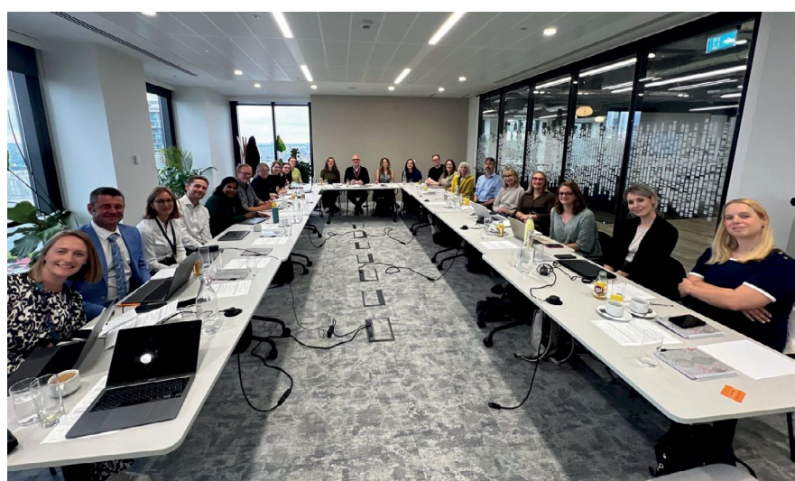
Genomics England Roundtable

Genomics England have collaborated with Cancer52 throughout 2024 and 2025, attending a Big Cancer52 Conversation and All Member Meeting, and hosting a roundtable event attended by 16 member charities to discuss genomics and rare and less common cancers.