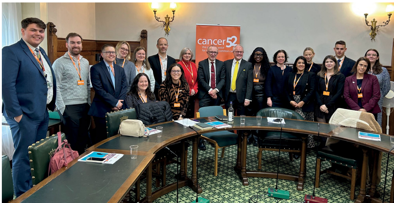
Patients, member charities, and MPs at the Parliamentary roundtable event.