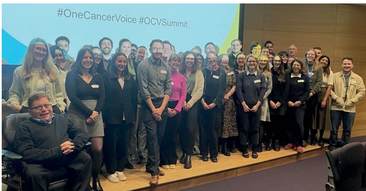
One Cancer Voice Summit

Cancer52 has led work that helps patients and their loved ones to access patient information and patient support relevant to their cancer type. Cancer52 has worked with Macmillan Cancer Support to initiate new links with their online patient information to signpost to smaller charities focused on rare and less common cancers.